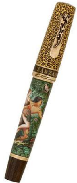
The Krone limited edition Tarzan fountain pen. (Thanks to Bibliophile Ken Kessler for telling us about this unique item.)

But you are in luck. These Krone pens can still be found on the Internet, with the rollerball pen at $5,119.99 and the standard fountain pen at $5,199.99 from Executive Essentials and others. What ERB fan can be without one? ☞