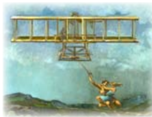
The 2009 Dum-Dum logo by Dayton artist Abner Cope