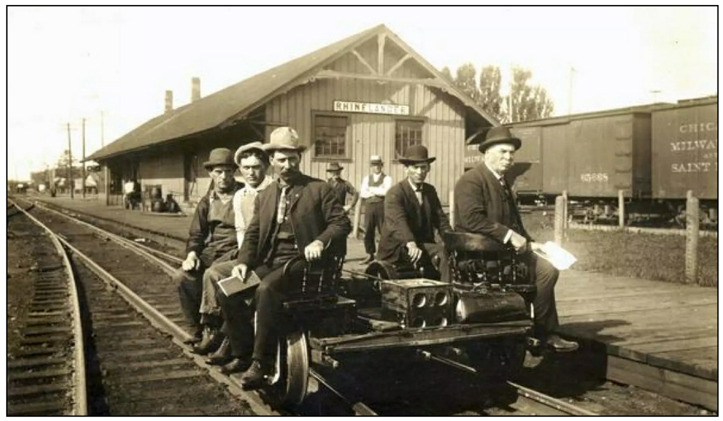
An early gasoline-powered hand car being used on the Minneapolis, St. Paul, & Sault Ste. Marie line for an inspection tour in 1908 in Rhinelander.