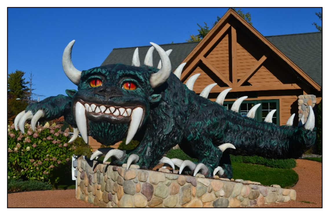
The Hodag statue in front of the Rhinelander Chamber of Commerce.

"Some say the Hodag is the fiercest, strangest, most terrifying monster ever to set razor-sharp claws on this earth. Others describe the Hodag as a reclusive woodland creature, misunderstood by many and only wanting to be left alone in the woodland