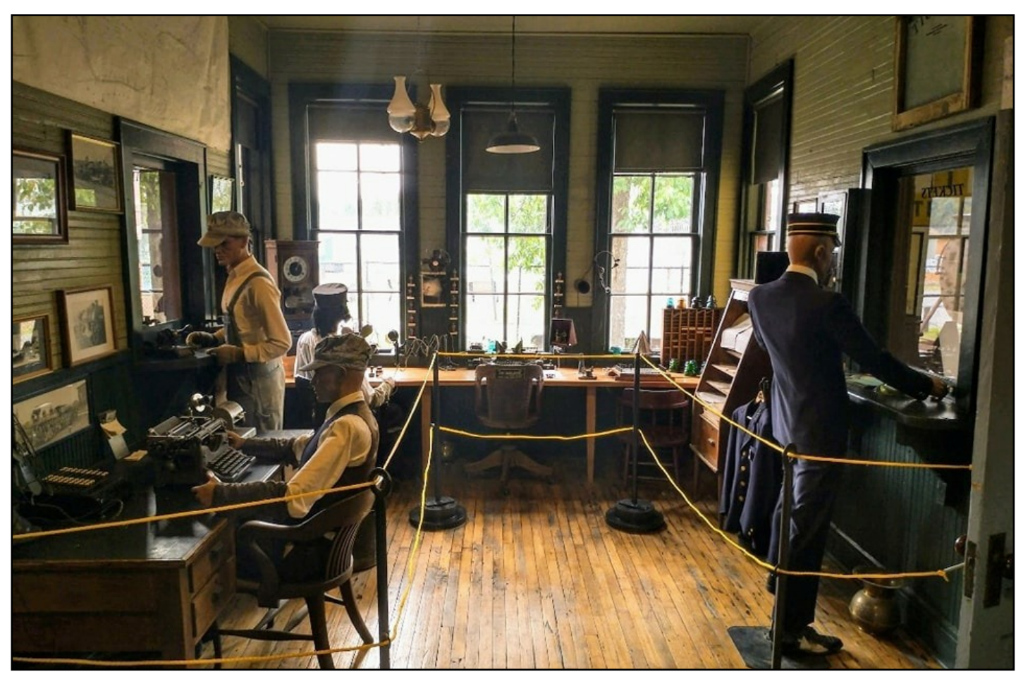
Inside the replica train station at the Railroad Museum in Rhinelander.

paradise that is the Rhinelander Area. No one really knows for certain, but for the people of Hodag Country, he's as real as the towering pines and the crystal clear lakes that encompass the area.