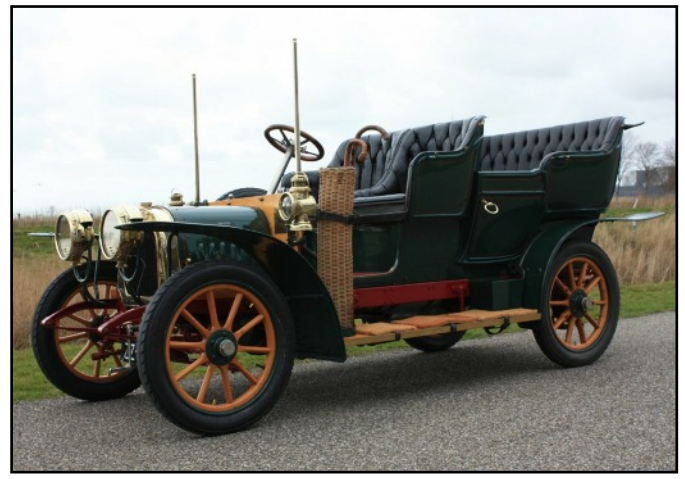
The Lion-Peugeot Type VC2.

Suddenly, out of the northeast, a great black car came careening down the road. With a jolt it stopped before