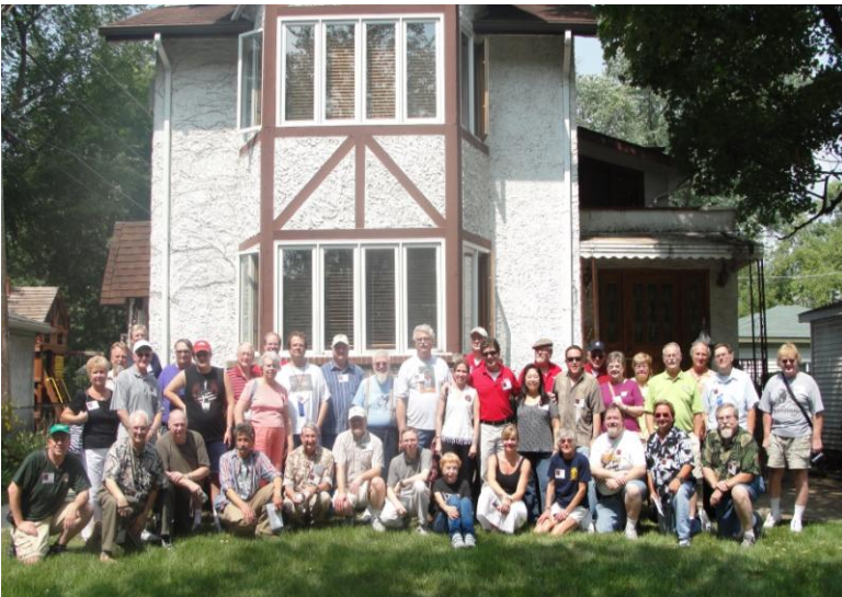
A stop during the tour of ERB's Oak Park homes and office; posing in front of 414 Augusta Street, where ERB lived from 1914 to 1917.