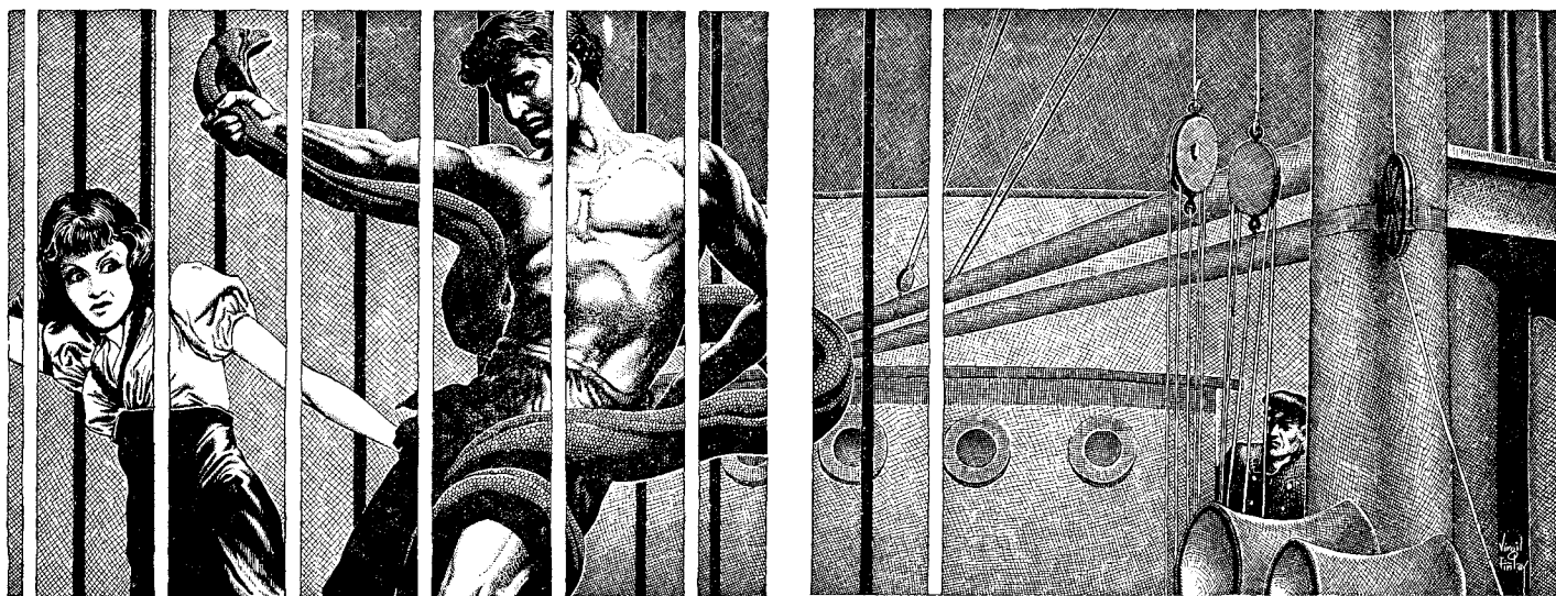
Silently the titanic struggle took shape, muscles of iron against writhing coils of steel. The girl watched in horrified fascination.

The interceding by Abraham Merritt to Argosy Weekly's editor to allow Virgil Finlay to illustrate his stories proved a boon to